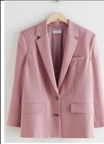
& Other Stories £98