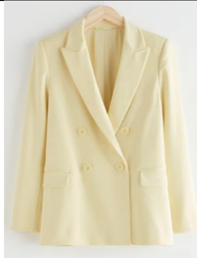
& Other Stories £65