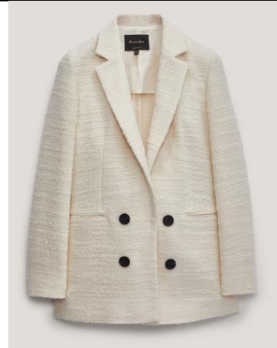
Massimo Dutti £99.95